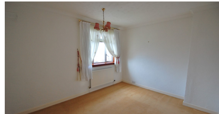
35 Graham Crescent Bo'ness