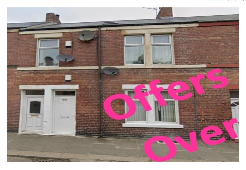
63 Laurel Street, Wallsend, Newcastle upon Tyne £ 59,950

David Robson and Associates now welcome to the market this 2 bedroom lower flat located on Laurel Street. A perfect opportunity for an investor looking for a project. This property does need some working doing to it however it does have amazing potential to expand and make beautiful. This a perfect base for a fresh start.