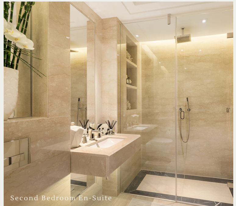
Second Bedroom En-Suite