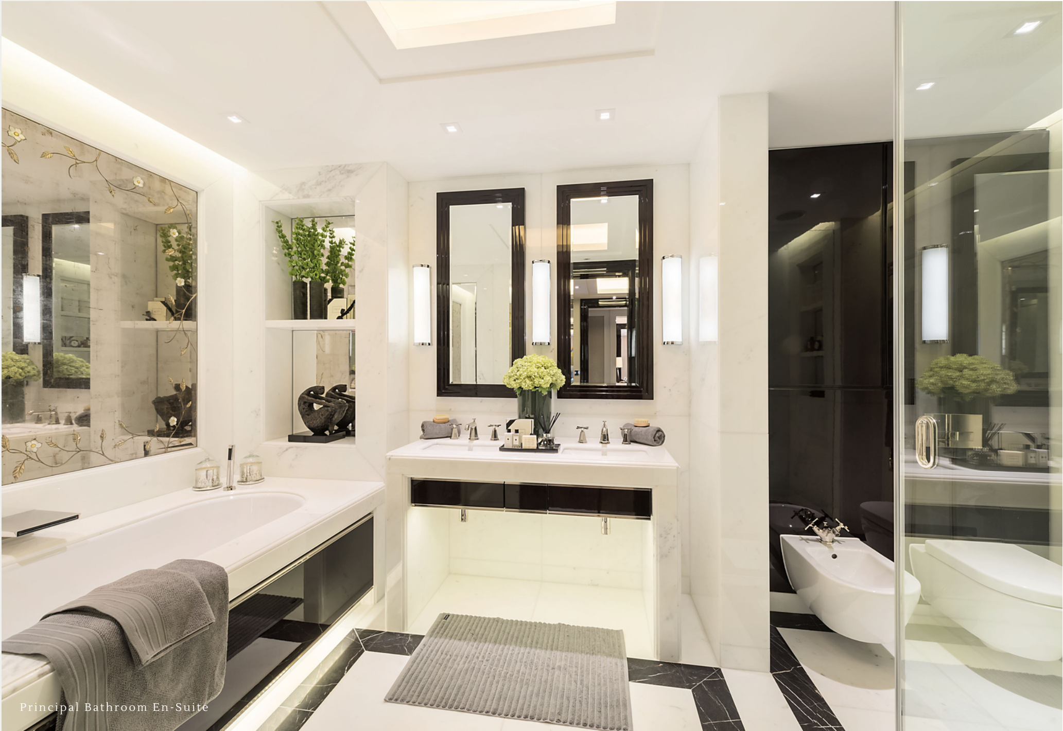
Principal Bathroom En-Suite