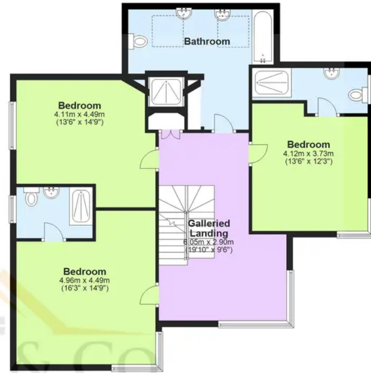
First Floor Approx. 99.2 sq. metres (1067.3 sq. feet)