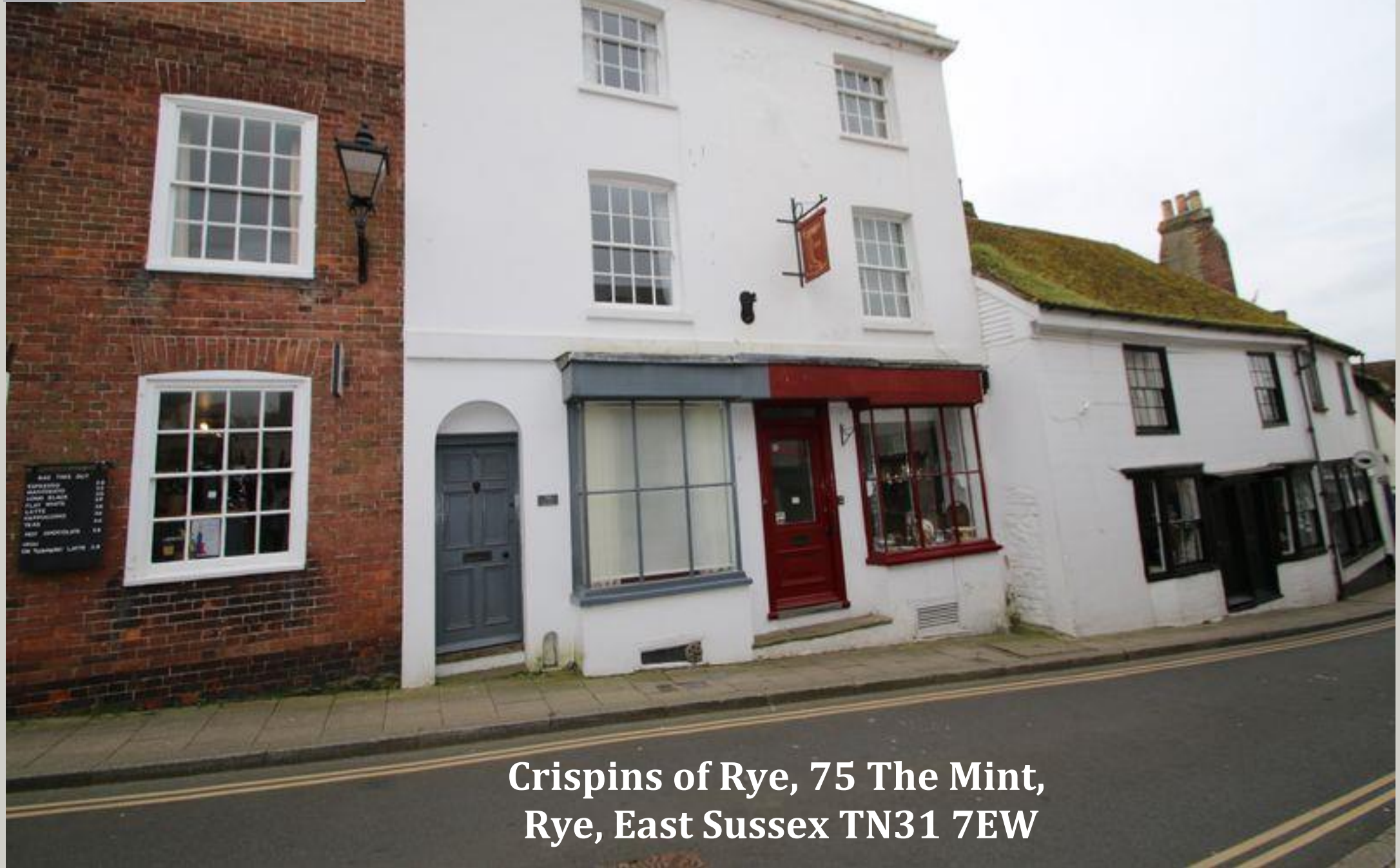
Crispins of Rye, 75 The Mint, Rye, East Sussex TN31 7EW