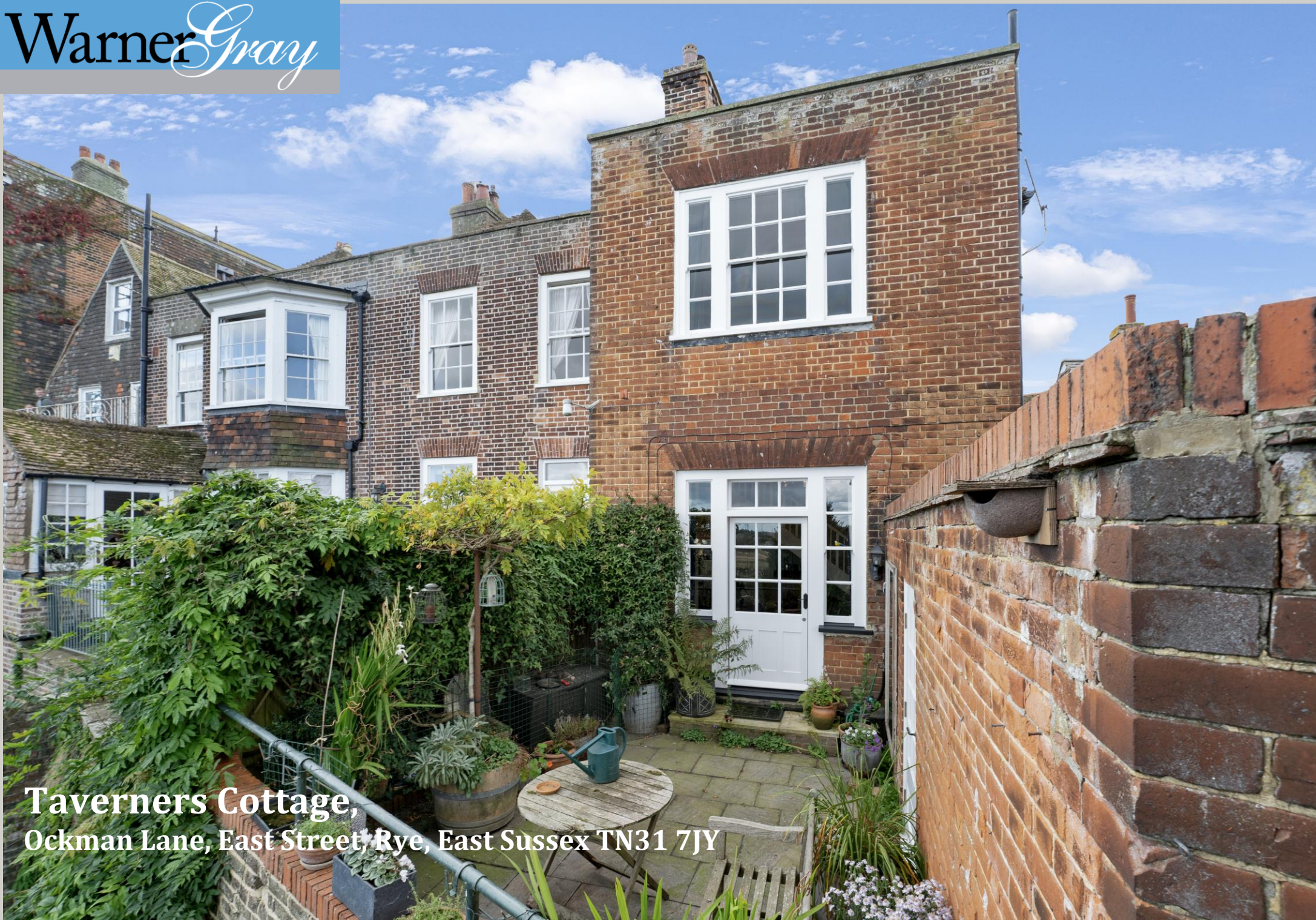
Taverners Cottage, Ockman Lane, East Street, Rye, East Sussex TN31 7JY