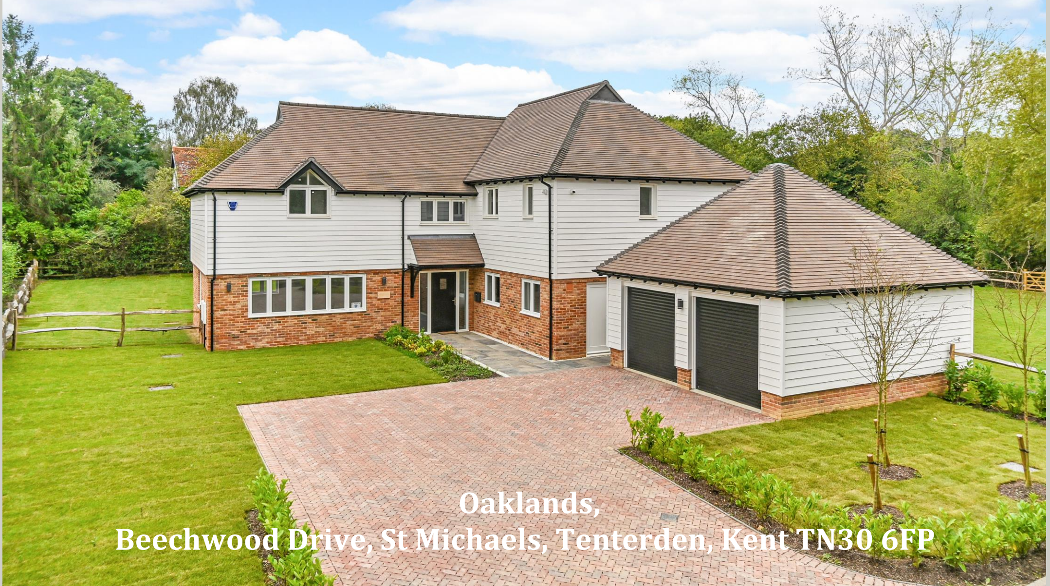
Oaklands, Beechwood Drive, St Michaels, Tenterden, Kent TN30 6FP