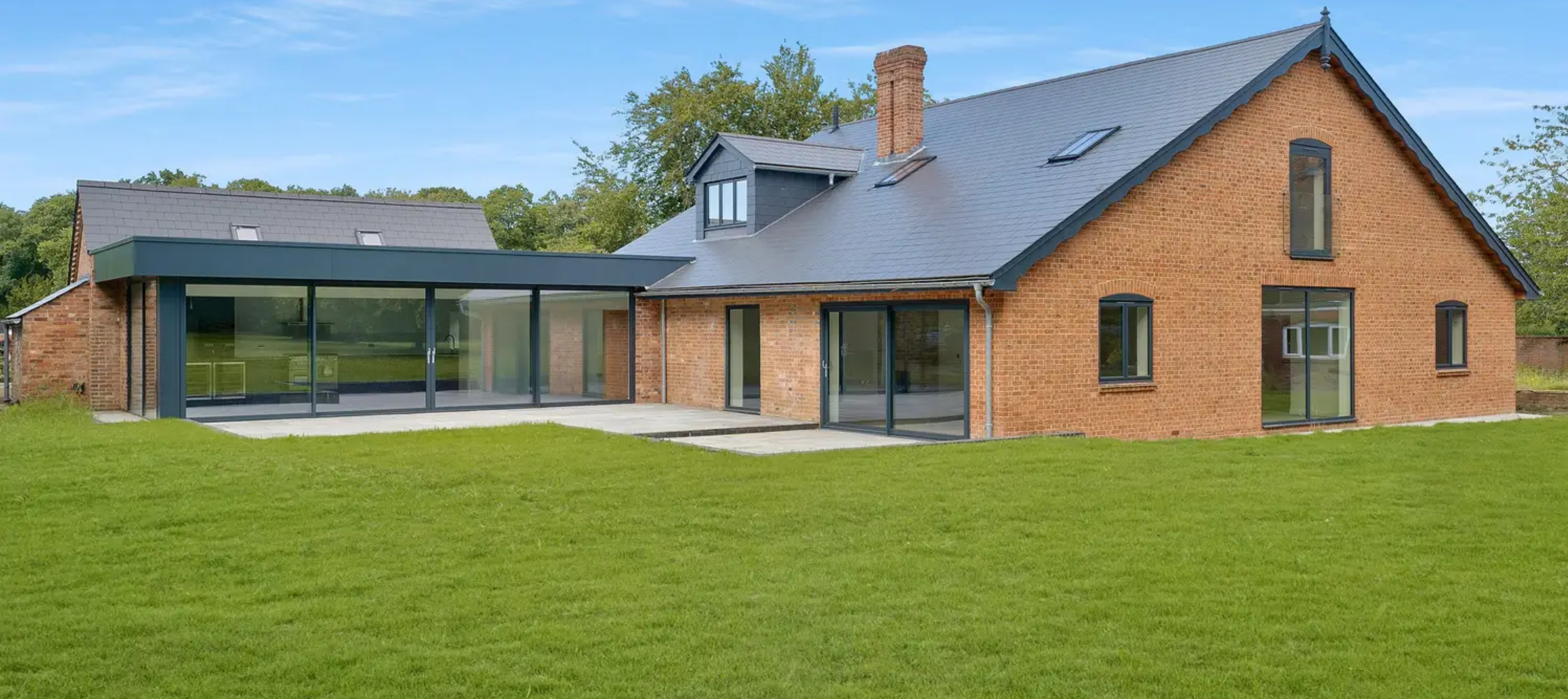
Orlestone Lodge, Ashford Road, Hamstreet £1,345,000