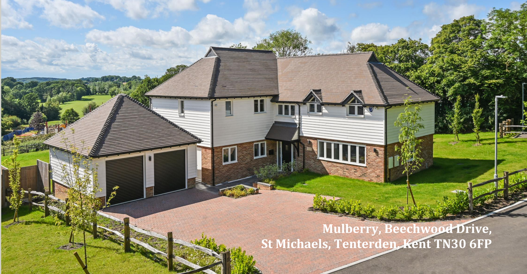
Mulberry, Beechwood Drive, St Michaels, Tenterden, Kent TN30 6FP