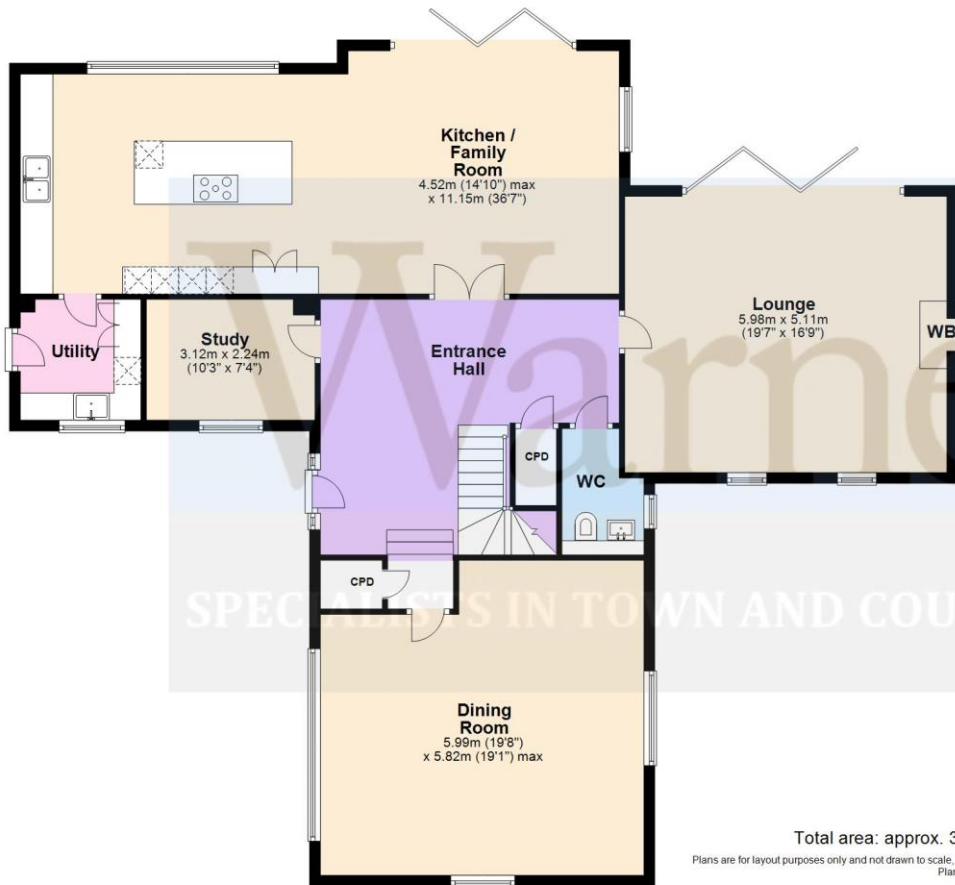
Ground Floor Approx. 154.3 sq. metres (1661.2 sq. feet)