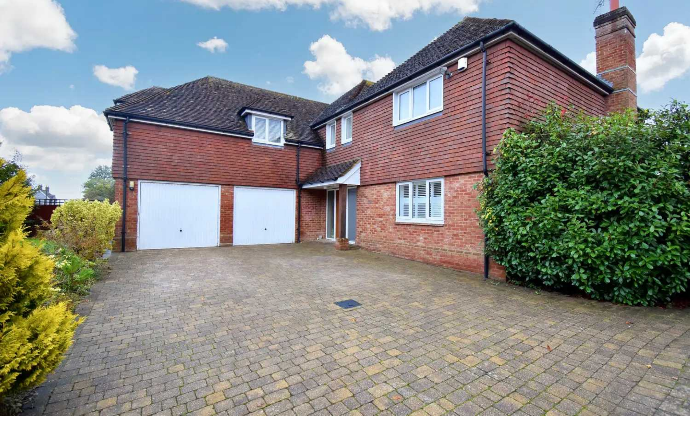
399 Canterbury Road, Kennington Offers in Region of £750,000