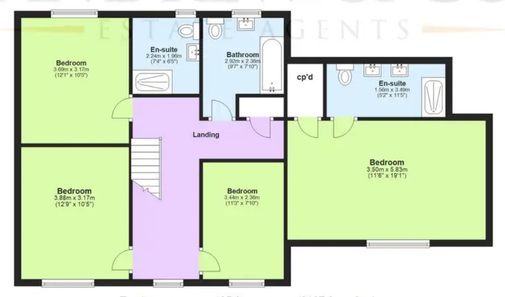
Total area: approx. 195.8 sq. metres (2107.2 sq. feet)