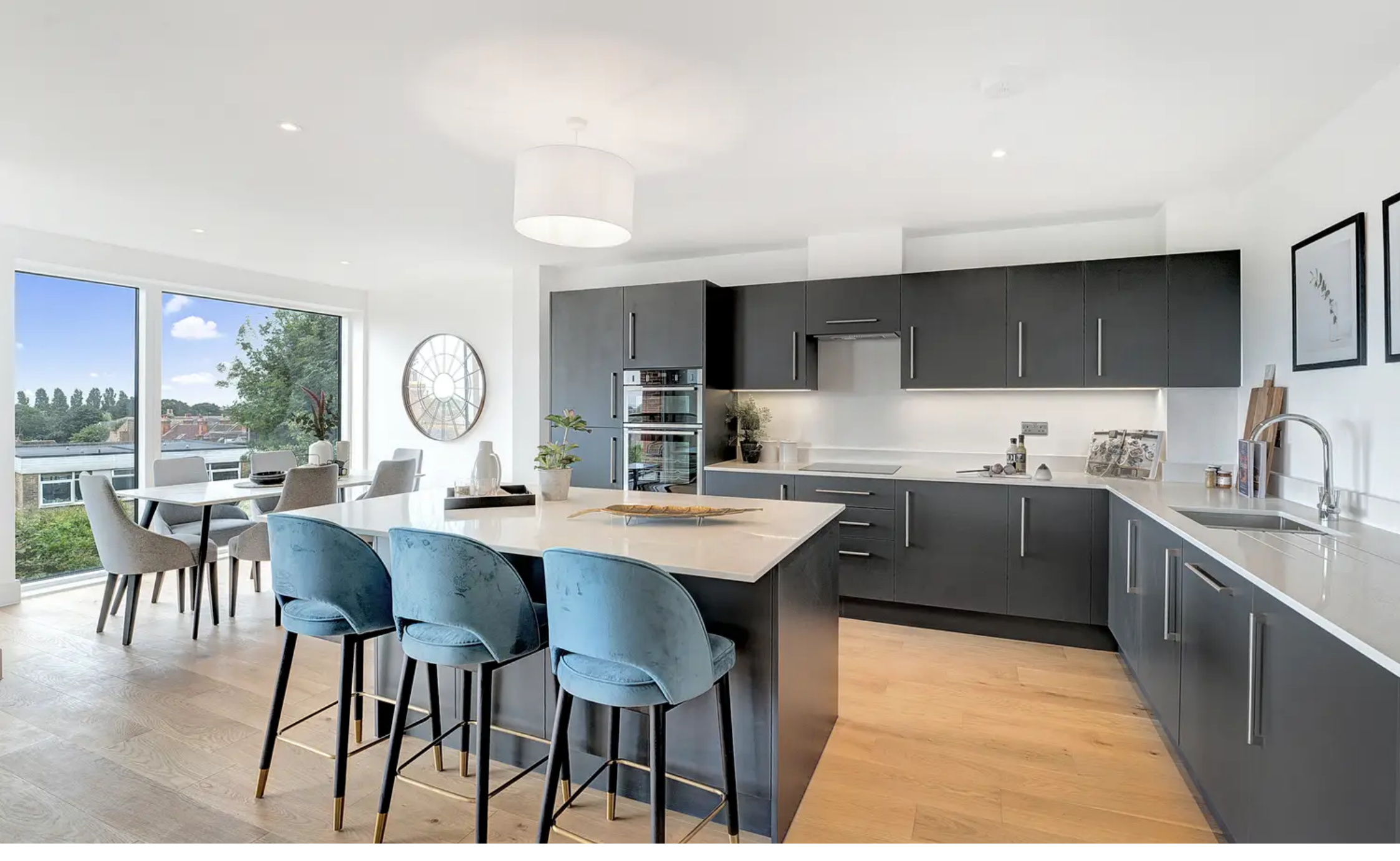
Ground Floor Apt, Bay Tree House, North Road, Hythe, Kent Offers in Region of £500,000