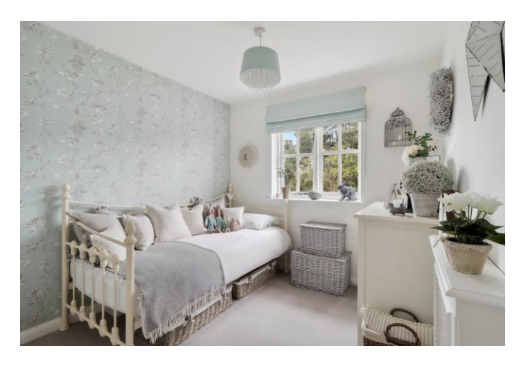
BEDROOM FOUR 7' 9" x 7' 2" (2.36m x 2.18m) Double glazed window to rear aspect. Radiator.

Double glazed window to rear aspect. Built in wardrobes. Radiator.