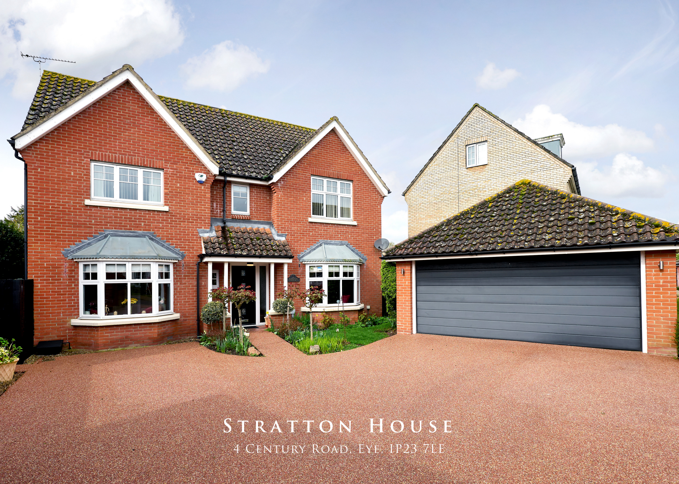
STRATTON HOUSE 4 CENTURY ROAD, EYE, IP23 7LE