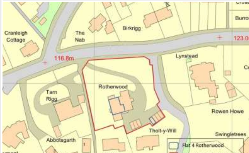
Ordnance Survey Plan