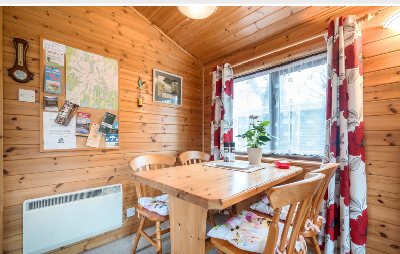
Living / Dining Room