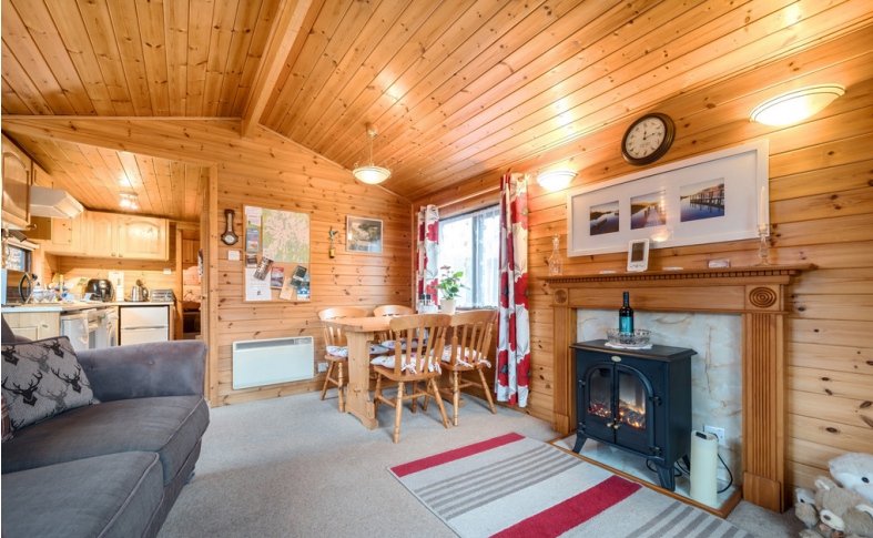
Living / Dining Room