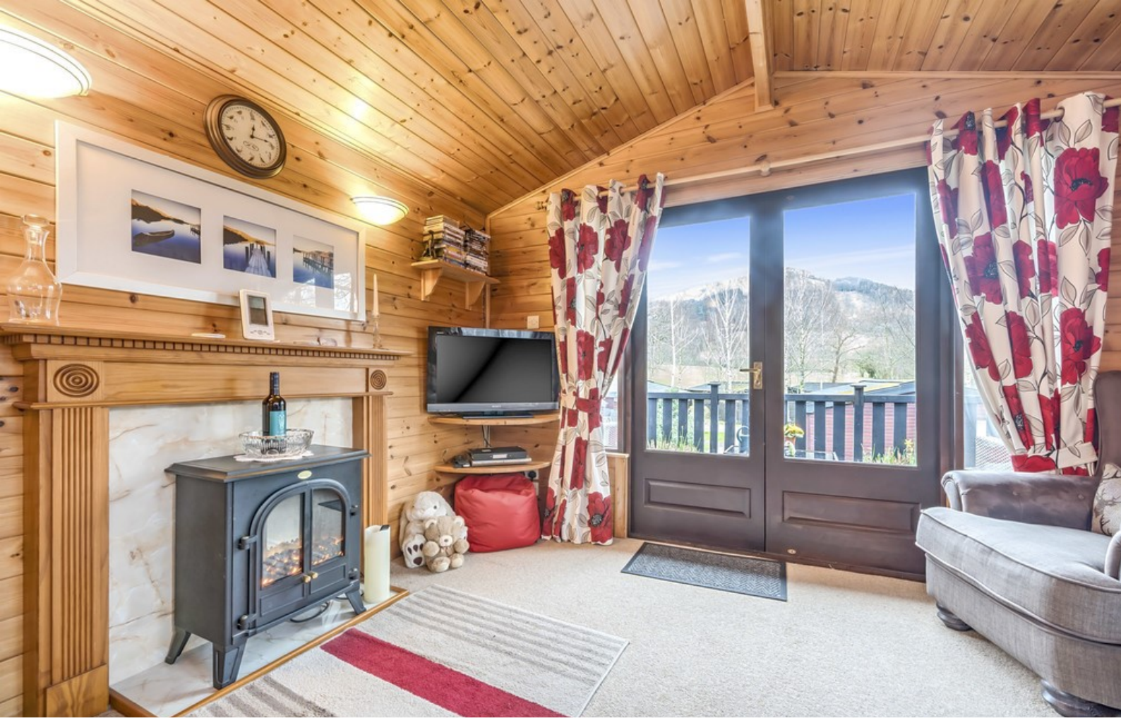
Living / Dining Room