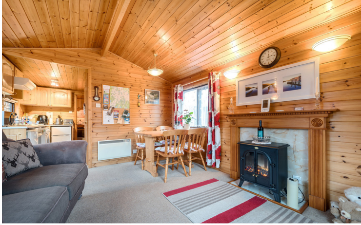
Living / Dining Room