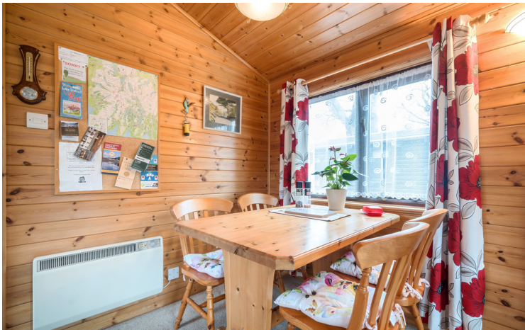
Living / Dining Room