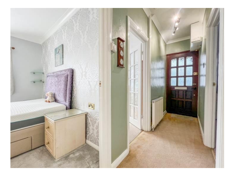
BEDROOM ONE 12' 11" x 10' 7" (3.94m x 3.23m) Double glazed window to the front aspect. Fitted wardrobes to one wall. Coving to plastered ceiling. Radiator.

Entrance via entrance door to ENTRANCE HALL Coving to plastered ceiling. Radiator.