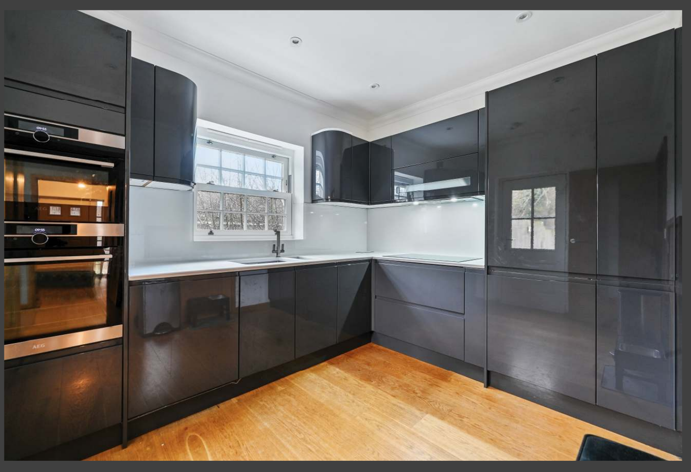
A detached 3-4 bedroom house with integral double garage and further recreational building comprising a detached double garage with adjoining gym and studio, walking distance to Appledore train station with connections to London in under an hour.