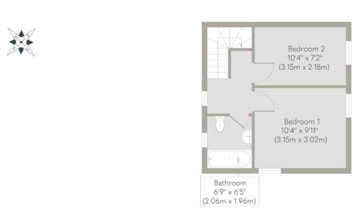
First Floor Approximate Floor Area 298 sq. ft (27.68 sq. m)