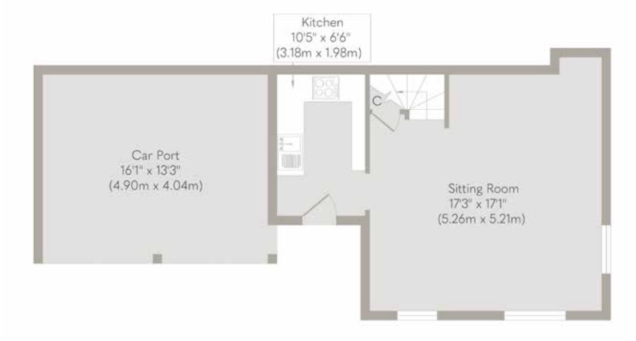
Ground Floor Approximate Floor Area 599 sq. ft (55.64 sq. m)

Whilst every attempt has been made to ensure the accuracy of the floor plan contained here, measurements of doors, windows, rooms and any other items are approximate and no responsibility is taken for any error, omission, or mis-statement. This plan is for illustrative purposes only and should be used as such by any prospective purchaser or tenant. The services, systems and appliances shown have not been tested and no guarantee as to their operability or efficiency can be given.