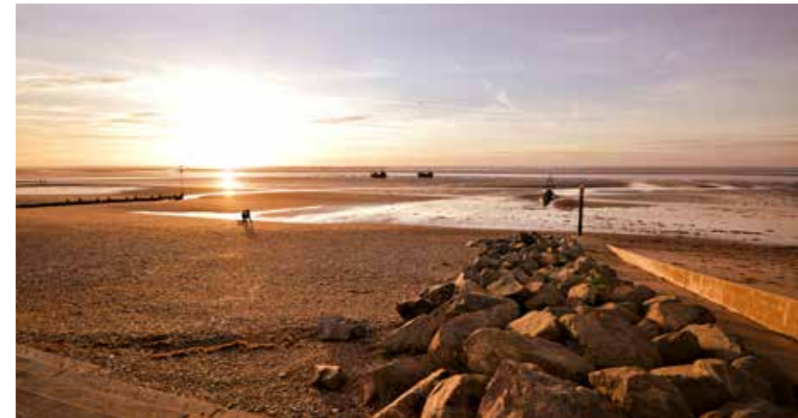
Sunset over Hunstanton beach.

“Sunny Hunny’ is famous for its incredible sunsets...”