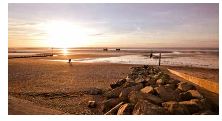
Sunset over Hunstanton beach

"'Sunny Hunny' is famous for its incredible sunsets..."