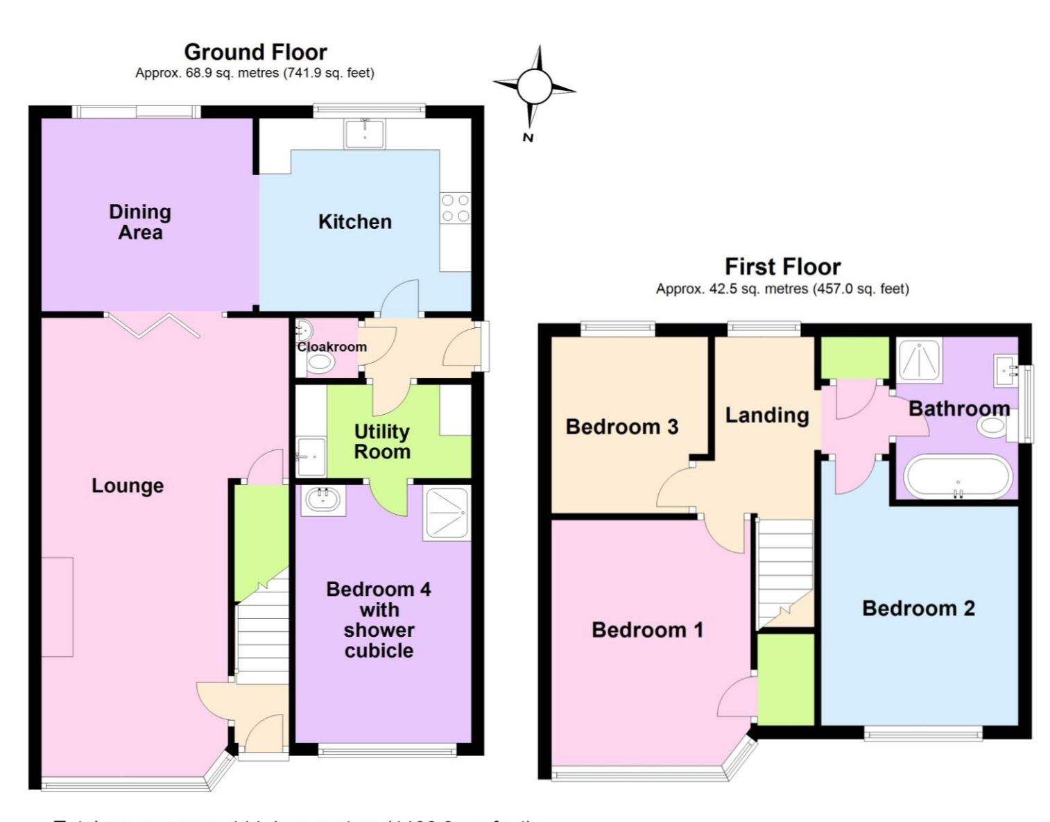
Total area: approx. 111.4 sq. metres (1198.9 sq. feet)