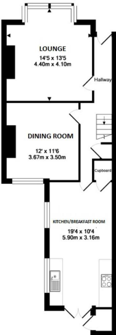
Ground Floor Approx. Floor Area 621 Sq.Ft. (57.7 Sq.M.)

If you're in the mood for something more local then you can take a stroll to either the Open House or The Park View which are both famous for their 'pub grub' and ideal for a few drinks after a long day at work.