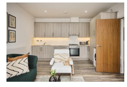
Park House, London NW10 OIEO £395,000 Leasehold

Sold chain free with a long lease of 999 years, this flawless apartment gloats engineered timber flooring, double glazing throughout and a fully fitted kitchen across under 700 sq ft of living space. Park House delivers extraordinary levels of affordable luxury living in a Central London area. Cleverly designed and thoughtfully laid out with an elegant open plan kitchen living area with bay windows, two well-proportioned double bedrooms (both with built in wardrobes) and two stunning modern bathrooms with one being an en-suite. Residents also benefit from a communal common room in the premises that is an annex to the stunning communal garden, great for entertaining family and friends. The common room can also be used as a shared work space.