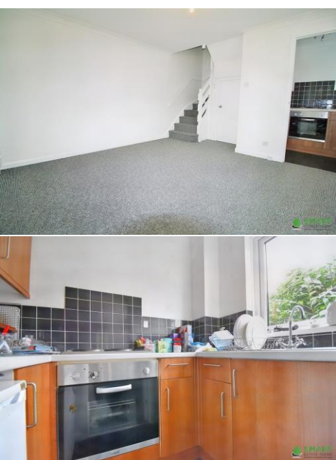
A spacious & modern one double bedroom end of terrace house located in Pennsylvania minutes from Exeter City Centre, being sold with no onward chain.