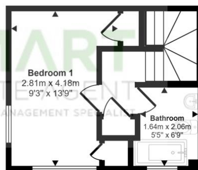
First Floor Approx 21 sq m / 222 sq ft