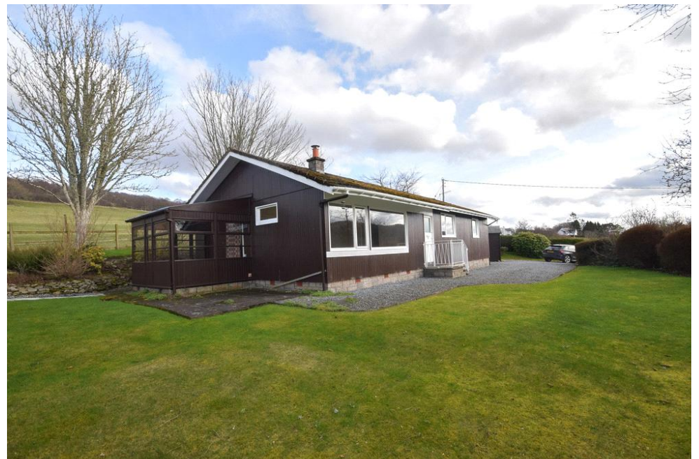
Next Home - Croftbeag, Croftinloan, Pitlochry, PH16 5TA