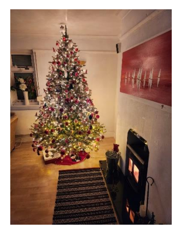
The large living room has plenty of space for family events yet remains cosy with the roaring fire.