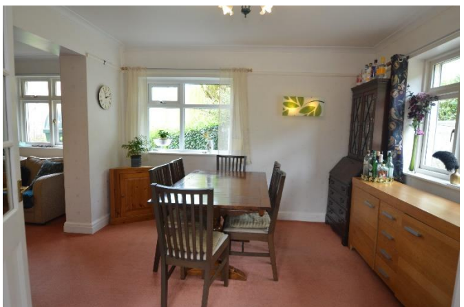
The dining room and kitchen are spacious.