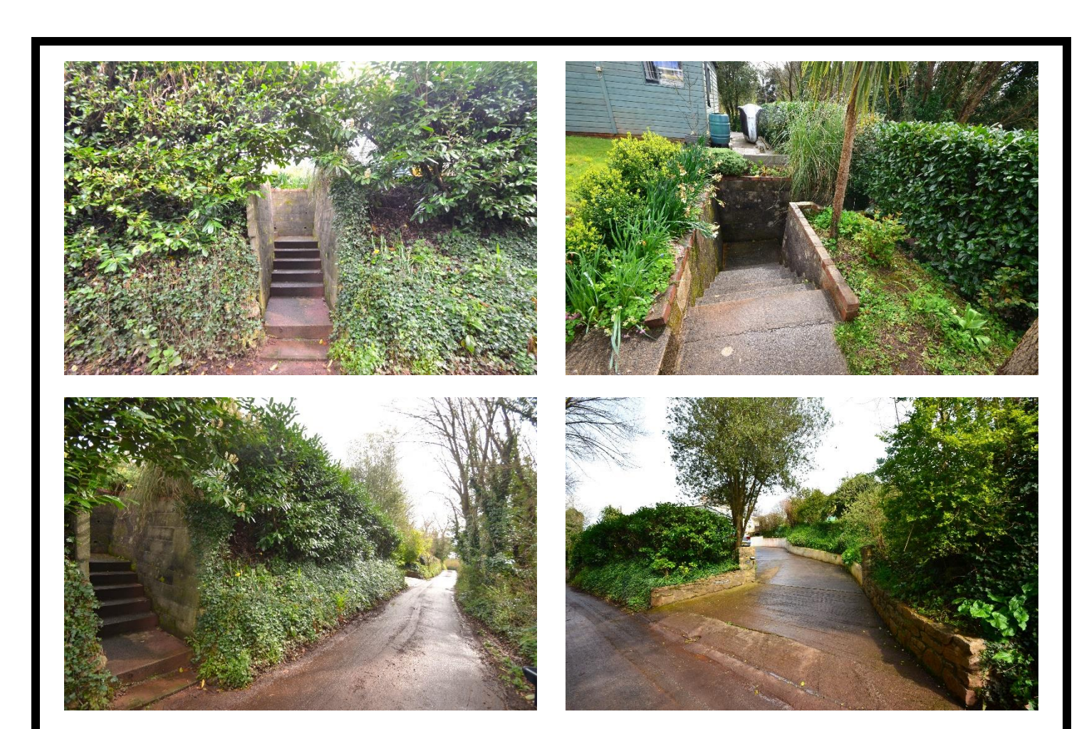
The entrances are situated 250 meters from the pavements into town.