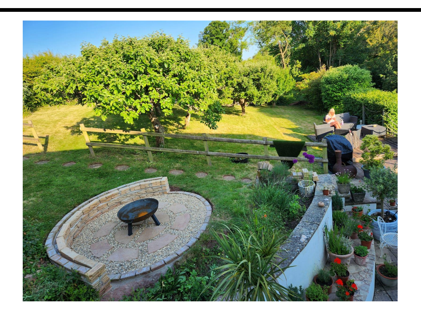
A garden for entertaining family and friends.