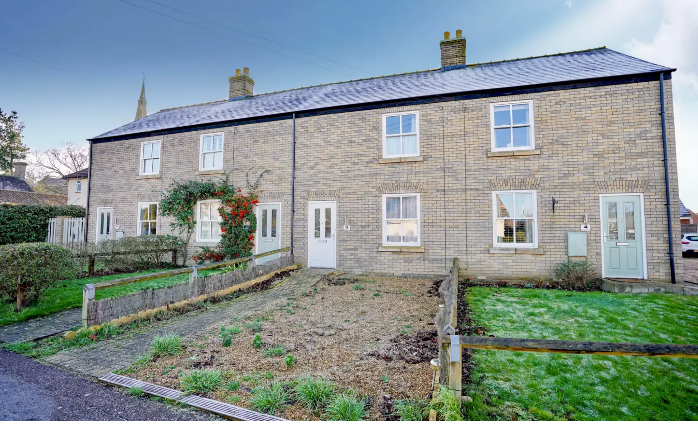
3 Vine Row High Street, Ellington In Excess of £300,000