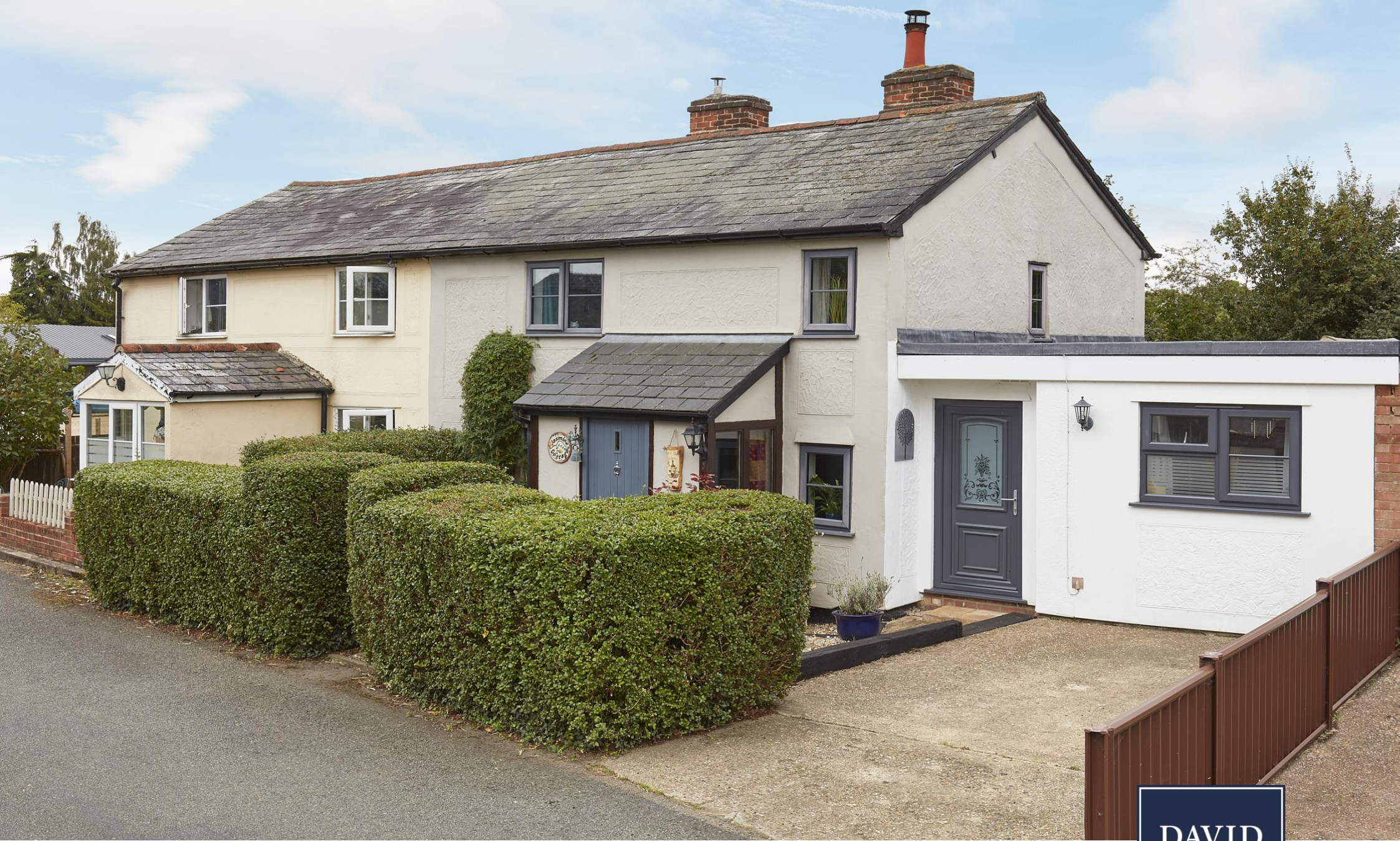
Jasmine Cottage Drury Lane, Ridgewell, Essex