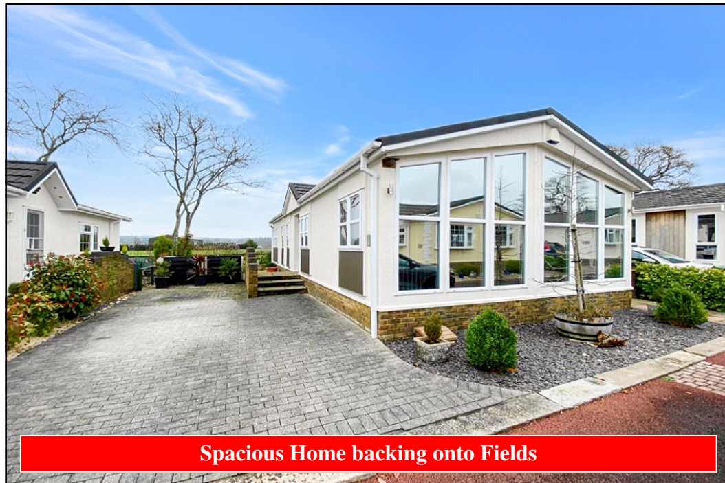
Spacious Home backing onto Fields

14 Bluebells Court, Organford Manor Country Park, Organford, Poole. BH16 6ES