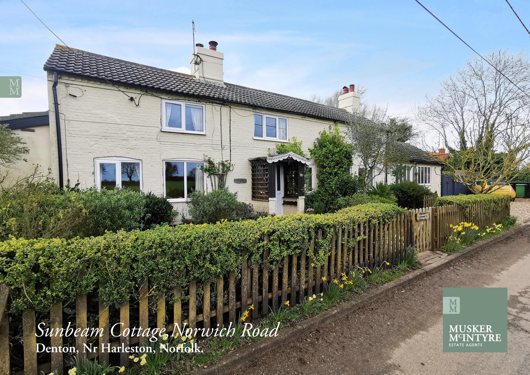
Sunbeam Cottage, Norwich Road Denton, Nr Harleston, Norfolk.