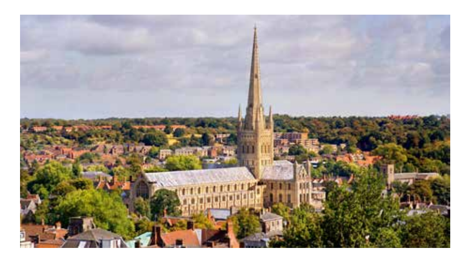
The cathedral city of Norwich offers great experiences, day or night.

"Along the A47 trunk, you can easily reach King's Lynn, Dereham, or Norwich."