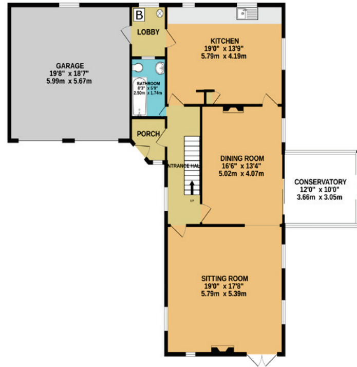
GROUND FLOOR 1508 sq.ft. (140.1 sq.m.) approx.