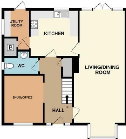
1ST FLOOR 595 sq.ft. (55.3 sq.m.) approx.