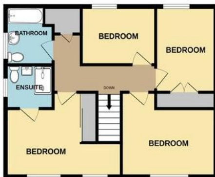
TOTAL FLOOR AREA: 1435 sq.ft. (133.4 sq.m.) approx.

Whilst every attempt has been made to ensure the accuracy of the floorplan contained here, measurements of doors, windows, rooms and any other items are approximate and no responsibility is taken for any error, omission or mis-statement. This plan is for illustrative purposes only and should be used as such by any prospective purchaser. The services, systems and appliances shown have not been tested and no guarantee as to their operability or efficiency can be given.