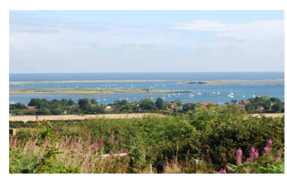
View of Brancaster Staithe