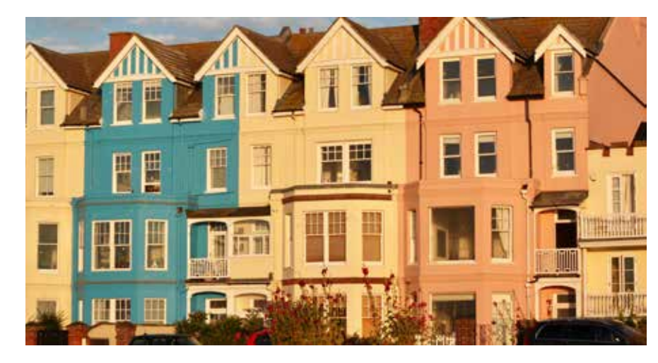
Aldeburgh Town Centre.

King's Lynn (11 miles away) has an excellent variety of shops, supermarkets, places to eat, ten-pin bowling alley, swimming pool, football club, cinema, theatre and three impressive churches. There are many services within the town including the Queen Elizabeth Hospital, police station, fire station, primary schools, three secondary schools, college and a library. King's Lynn is connected to the local cities of Norwich and Peterborough via the A47 and to Cambridge via the A10.