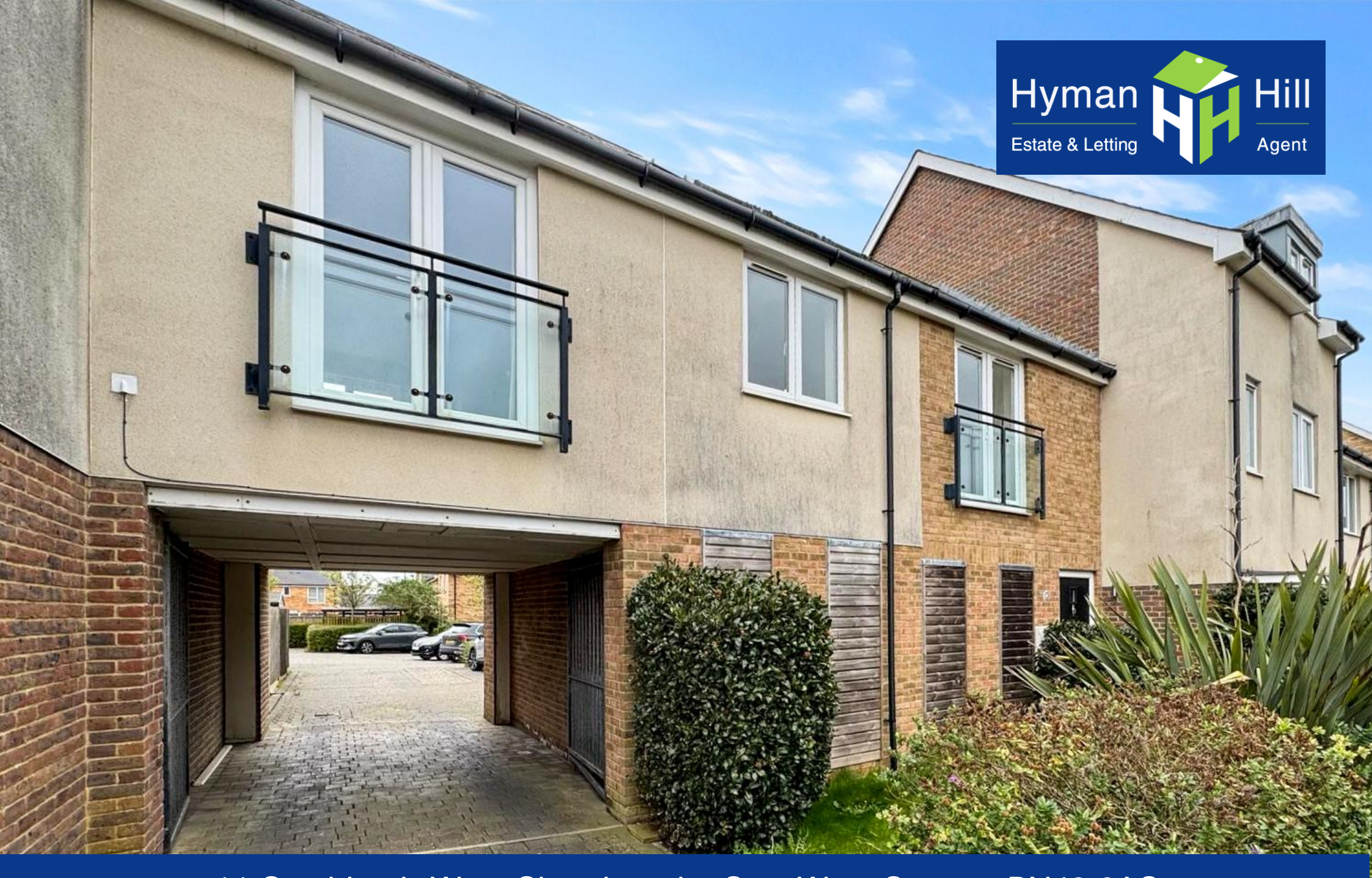
11 Southlands Way, Shoreham-by-Sea, West Sussex, BN43 6AS