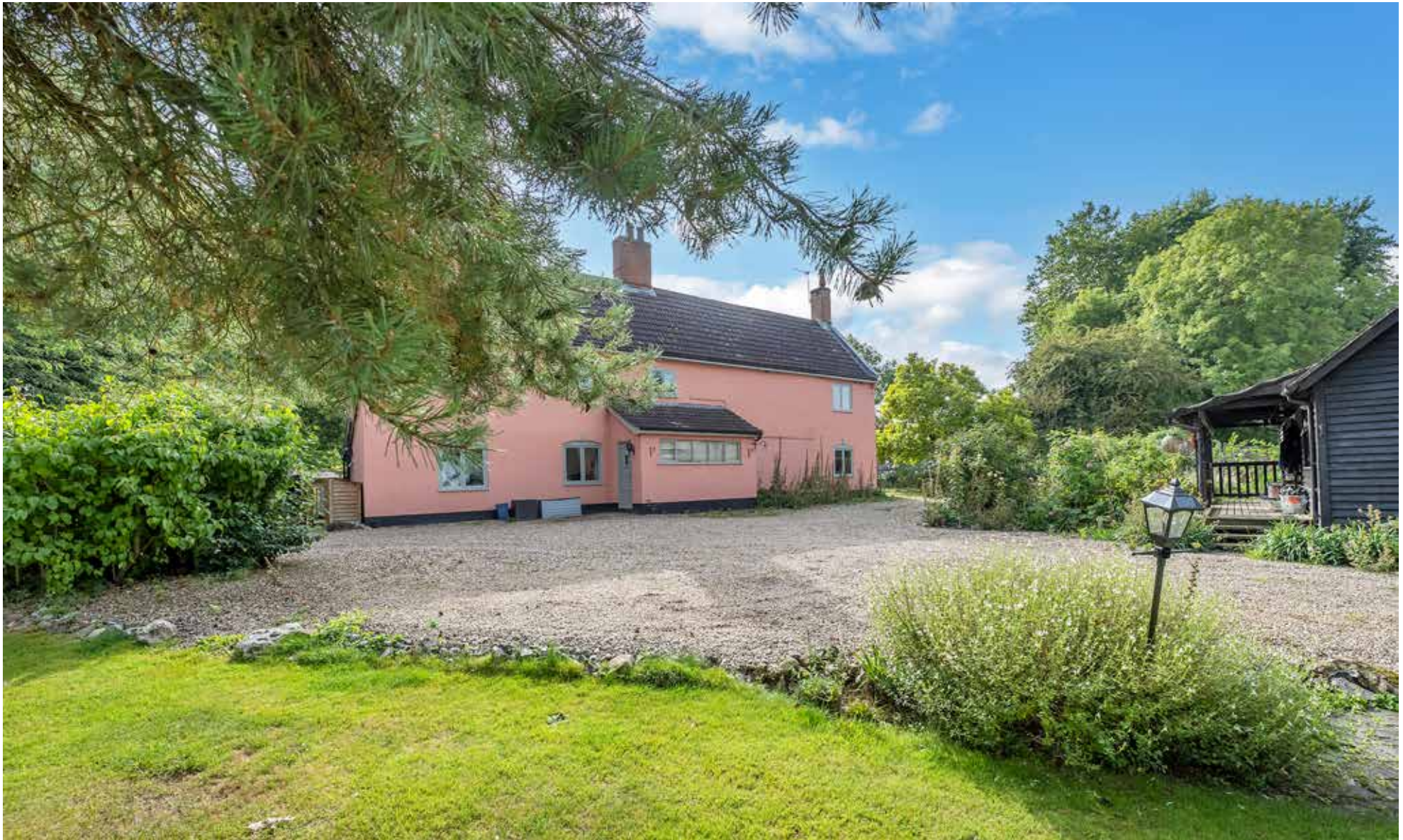
'BEAUTIFUL PERIOD FARMHOUSE' Thrandeston, Suffolk | IP21 4BN