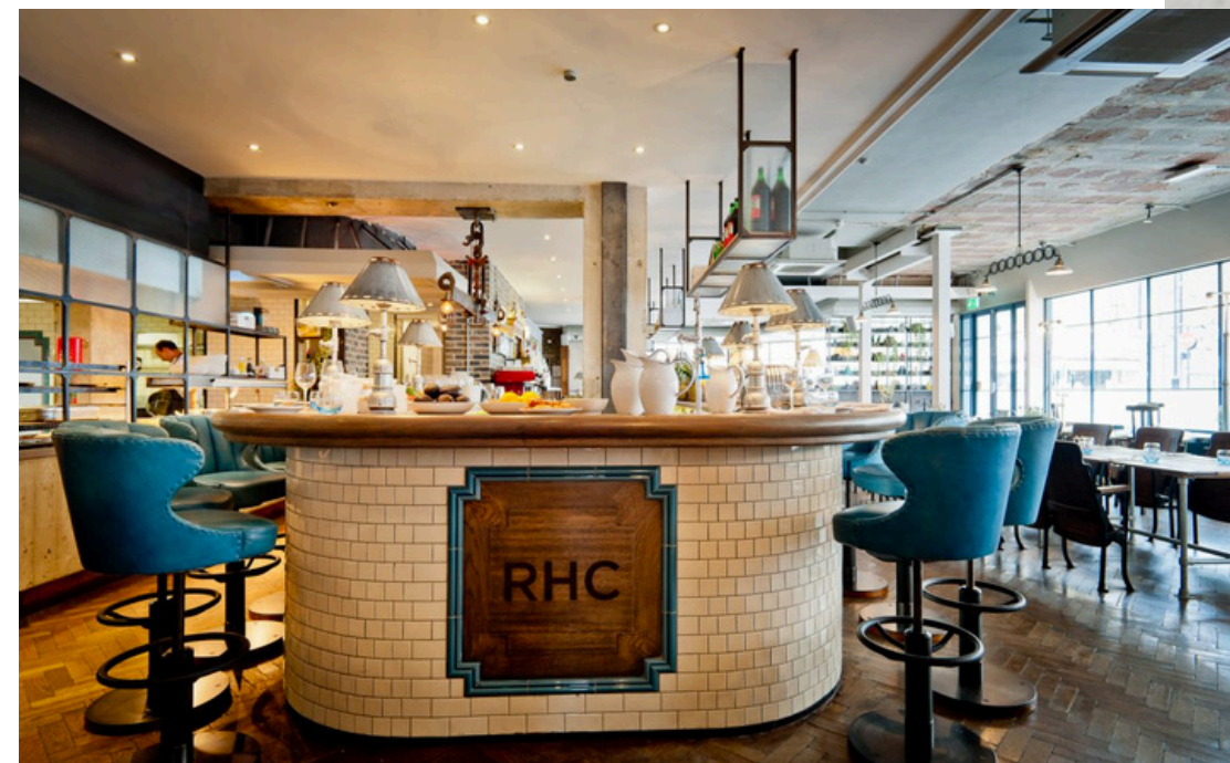
The Riding House Cafe