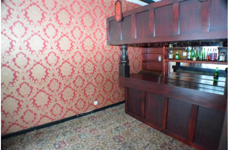
St John Street is also within 100 metres of the local shops, convenience stores and takeaways. Bridgwater is an emerging town situated in the heart of the borough of Sedgemoor and within 11 miles of Taunton and 38 miles of Bristol. The town which is famed for its annual carnival is a thriving place with many new jobs being created in recent years. For more information or an appointment to view please contact the vendors sole agents.

Leasehold - 300 years from 25 March 1862. Ground Rent – Not paid.