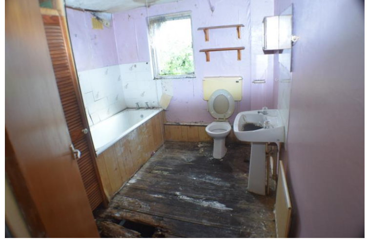
Bridgwater is an emerging town situated in the heart of the borough of Sedgemoor and within 11 miles of Taunton and 38 miles of Bristol. The town which is famed for its annual carnival is a thriving place with many new jobs being created in recent years. For more information or an appointment to view please contact the vendors sole agents.

SERVICES: Mains gas, electricity, water and drainage HEATING: Gas fired central heating system.