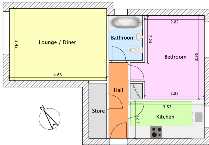
Indicative floor plans for illustration purposes only Approximate Gross Internal Floor Area 484 ft 2