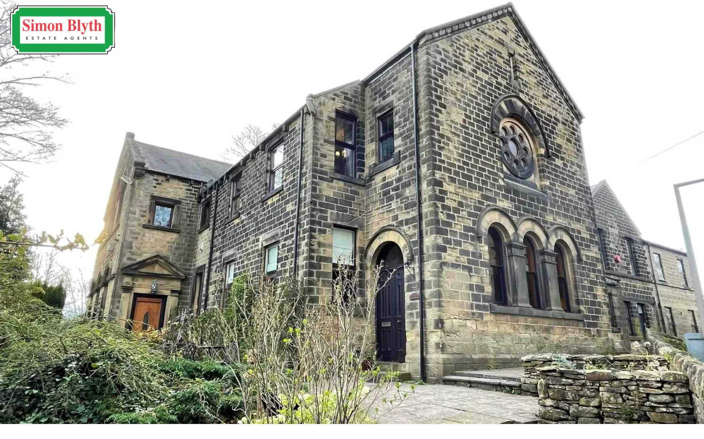
Tolson Court Huddersfield Road, Penistone