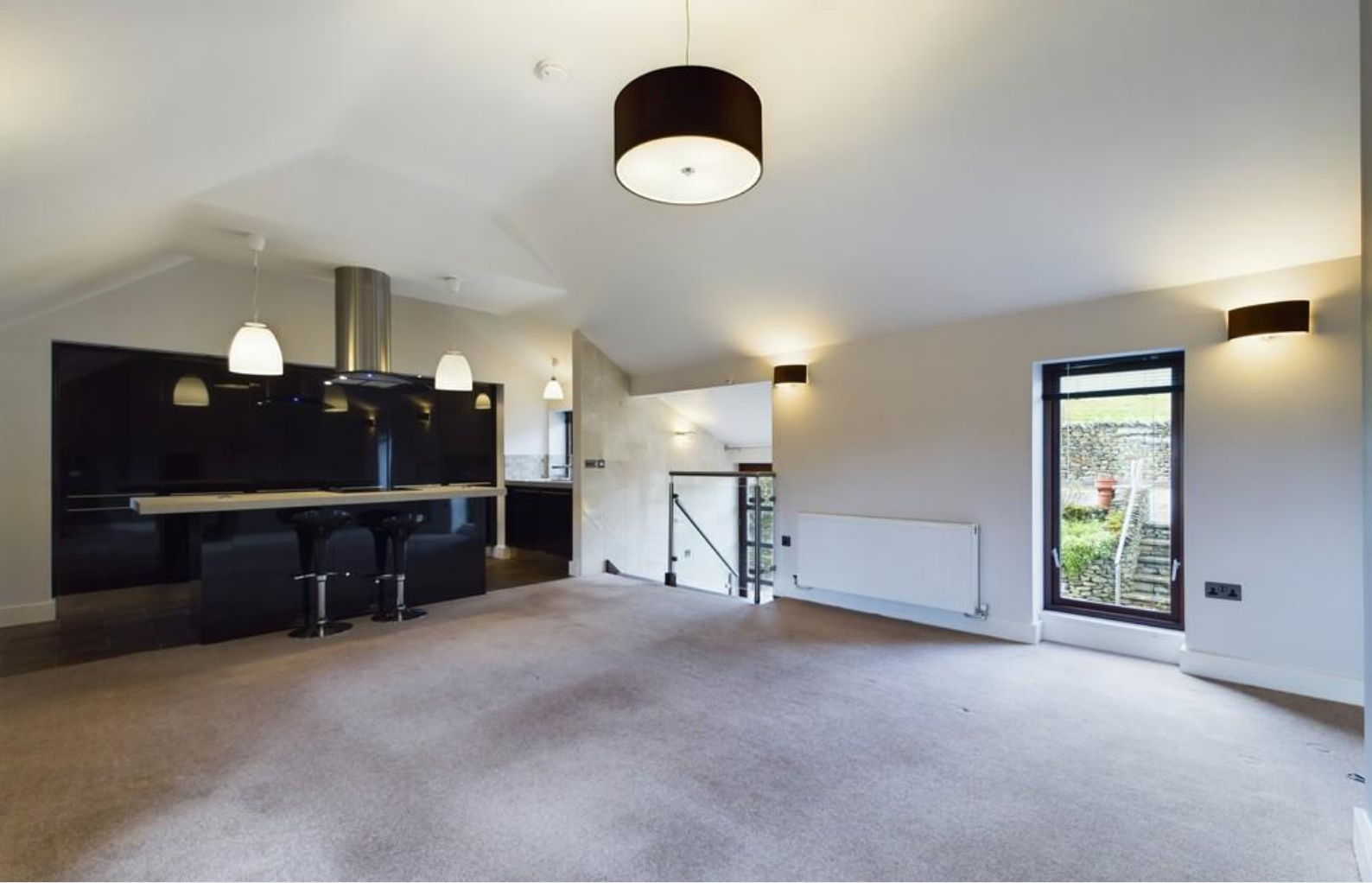
Kitchen Living Room