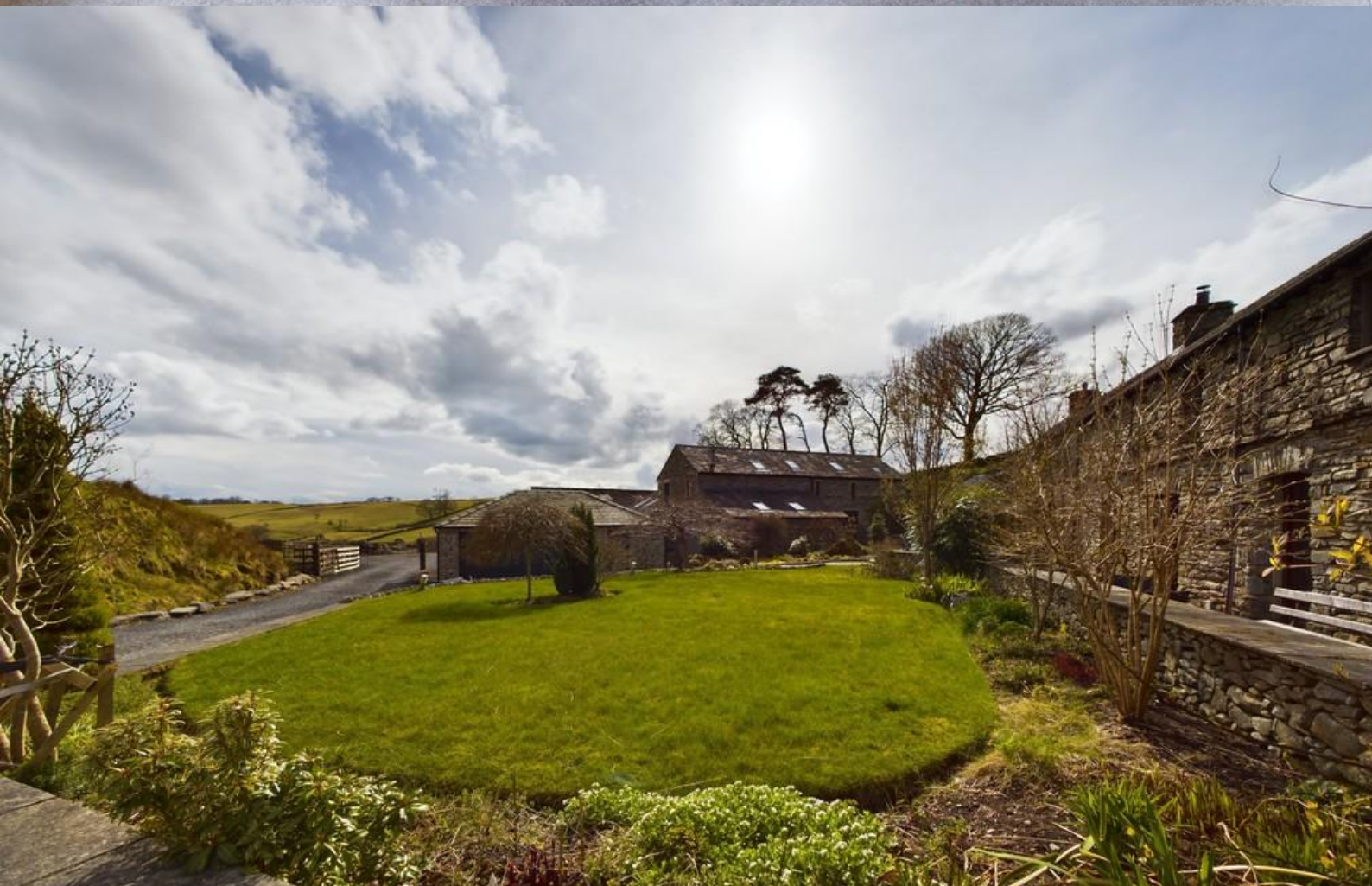
Communal Rear Garden