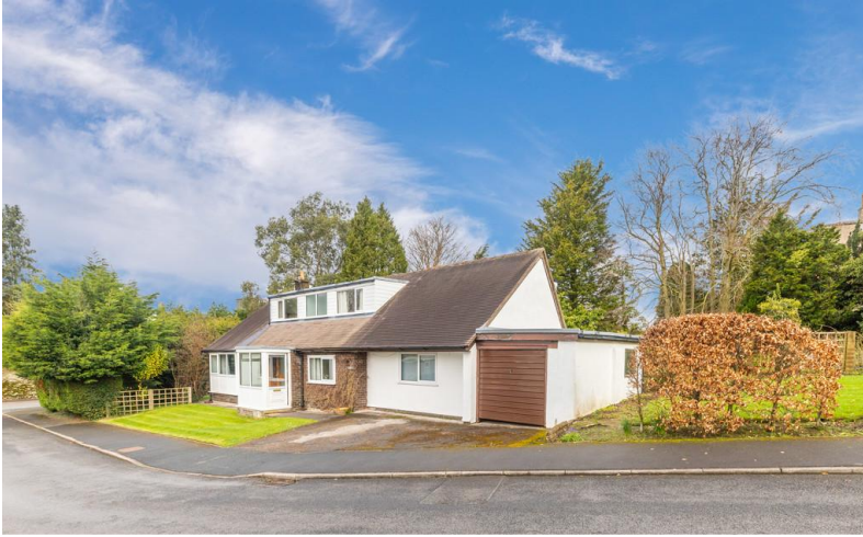
1 Mowbray Drive

Location Burton in Kendal is a charming and sought-after village located in the south of Cumbria, surrounded by rolling countryside and stunning views of the surrounding hills. The village has a rich history and a strong sense of community, making it an ideal place to live for families, professionals and retirees alike.