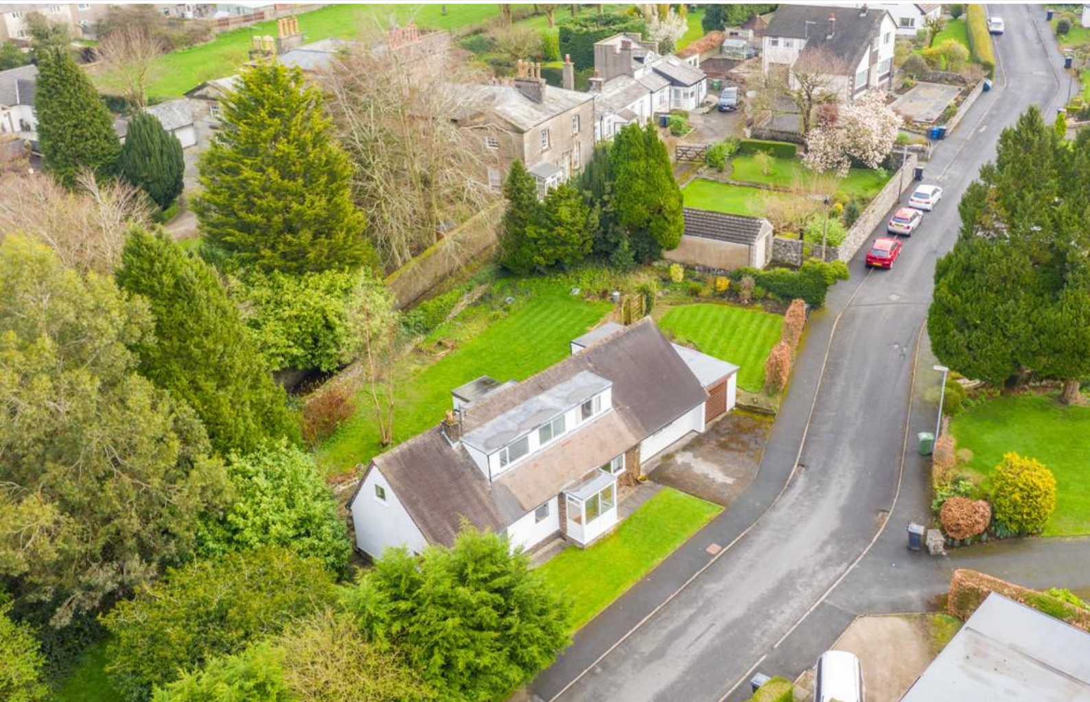
1 Mowbray Drive