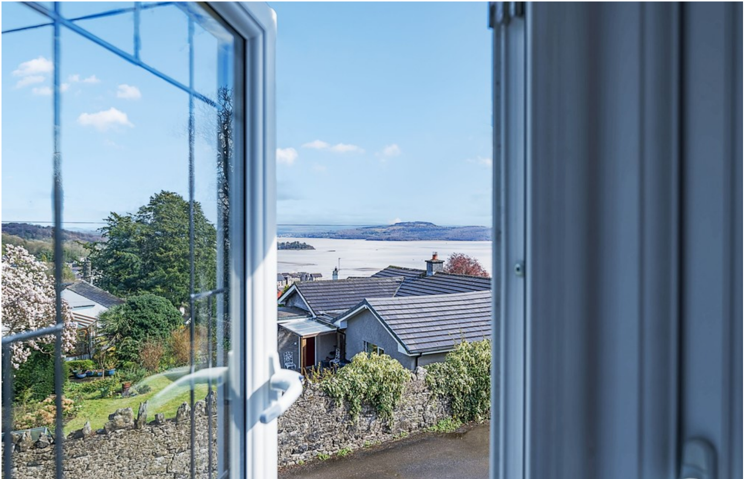
Bedroom 1 Window