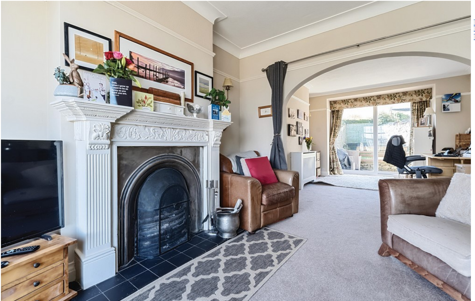
Openplan Lounge and Dining Room