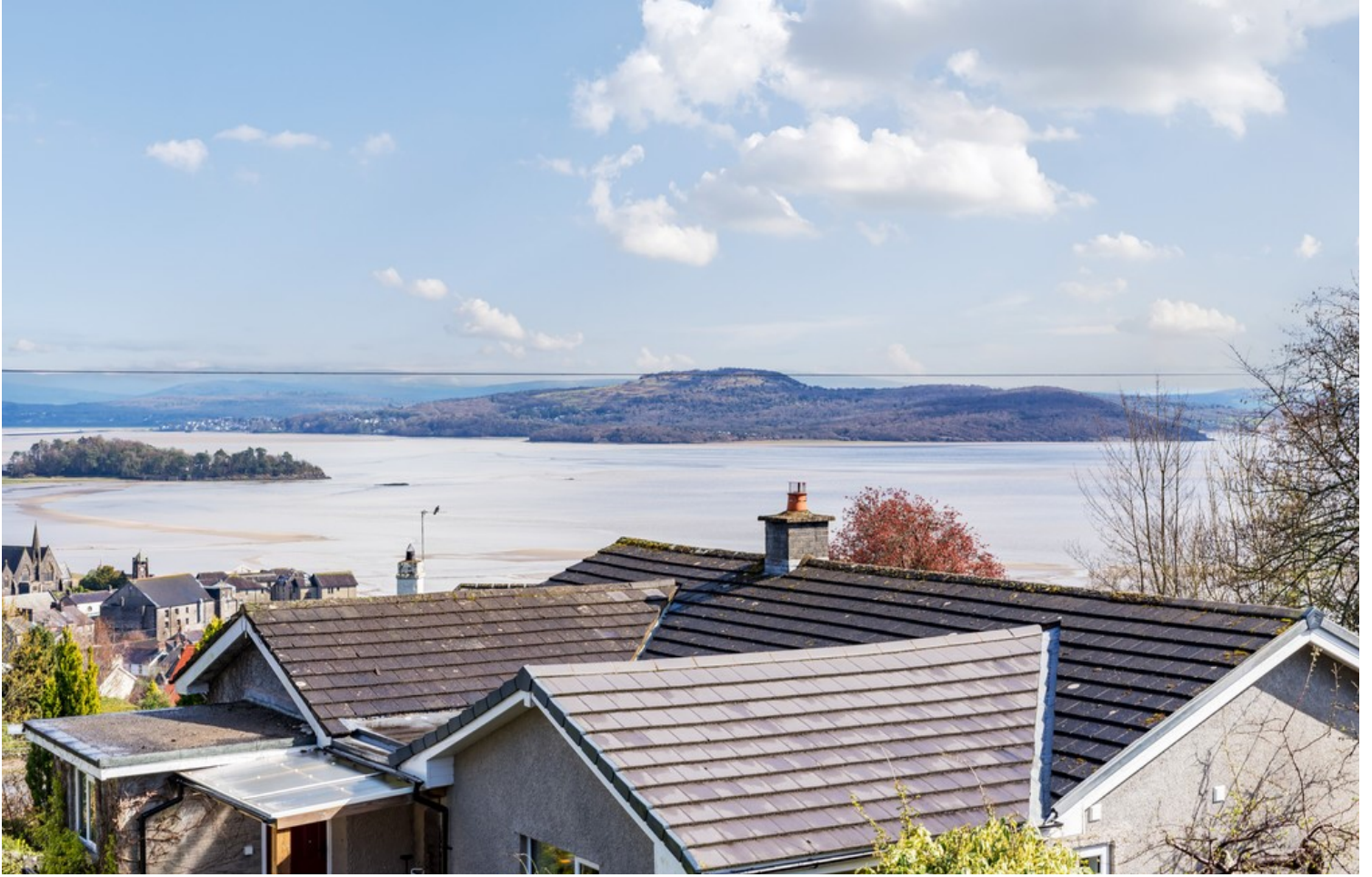
View from Bedroom 1