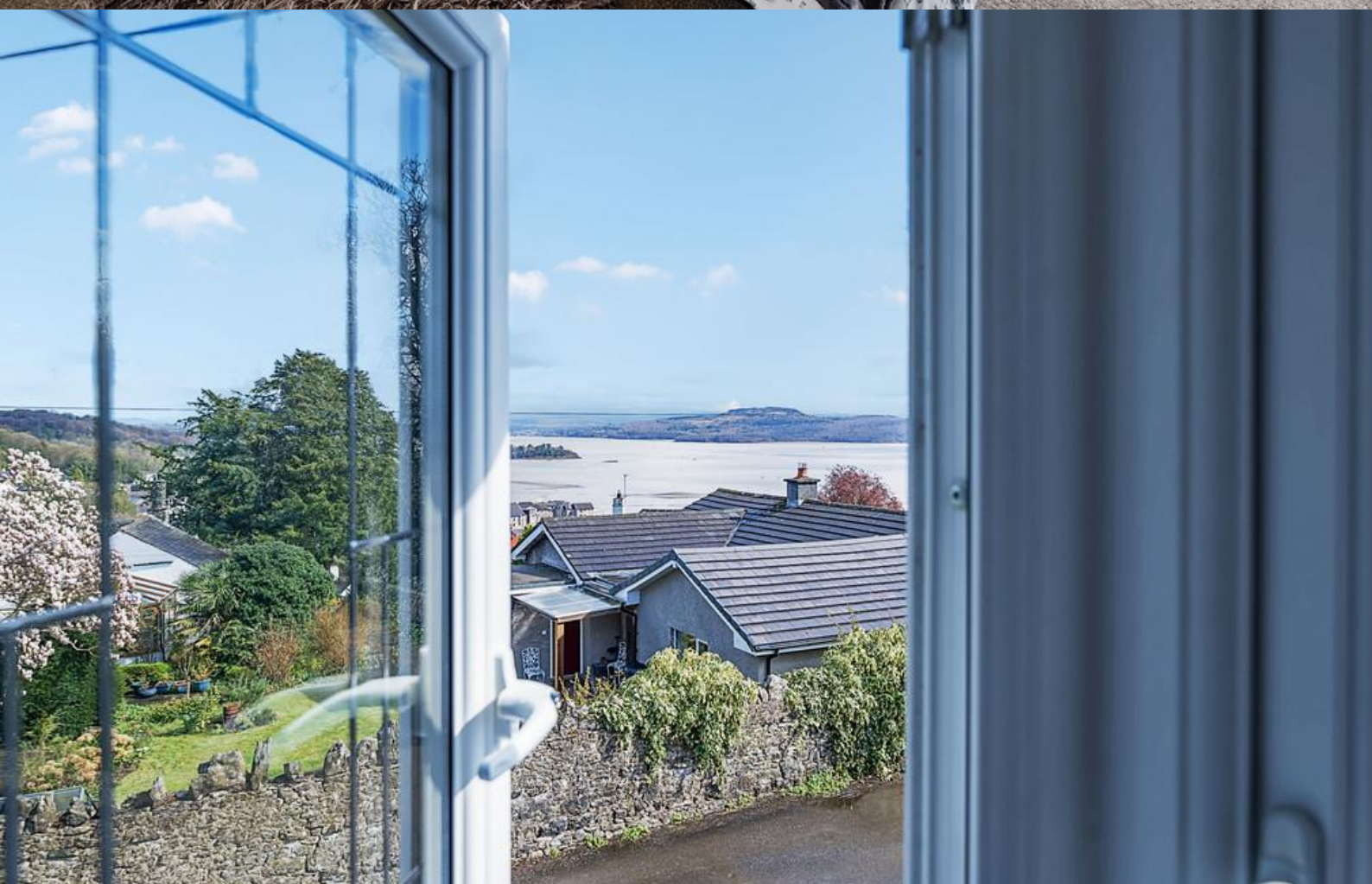
Bedroom 1 Window