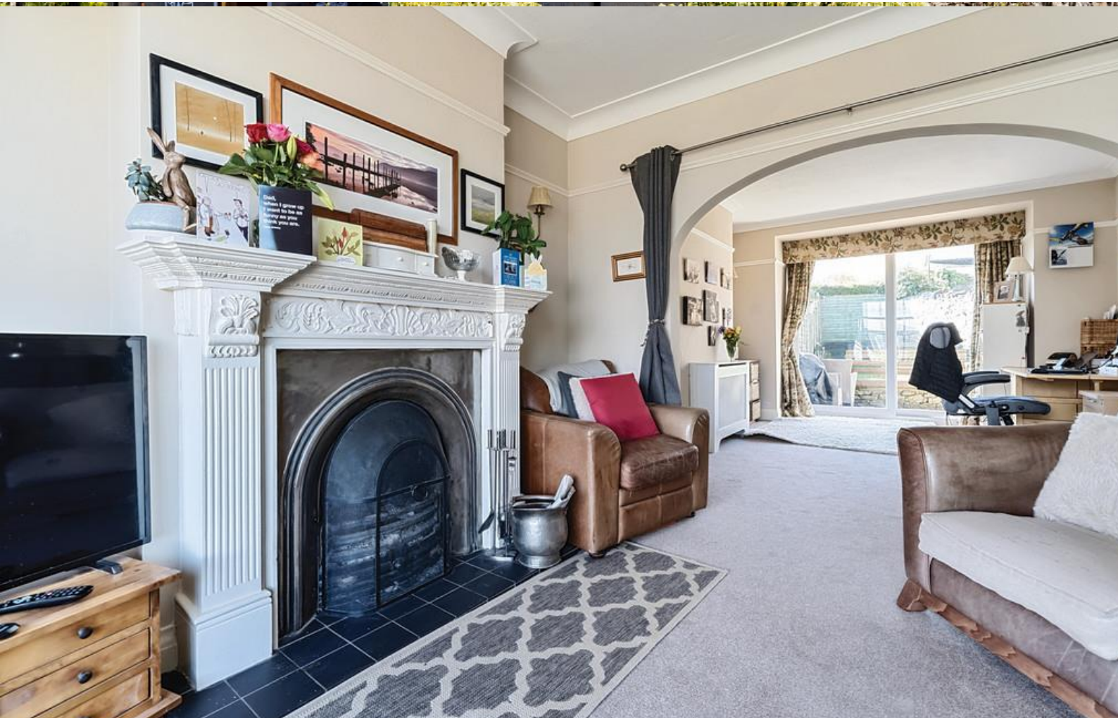
Openplan Lounge and Dining Room