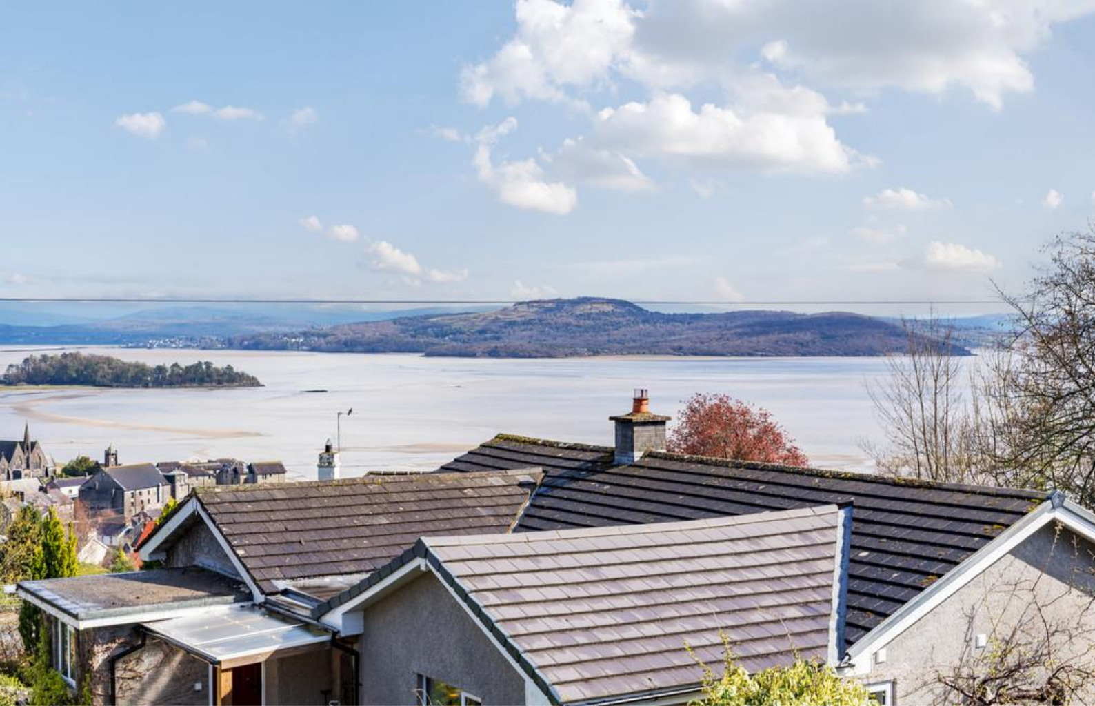
View from Bedroom 1