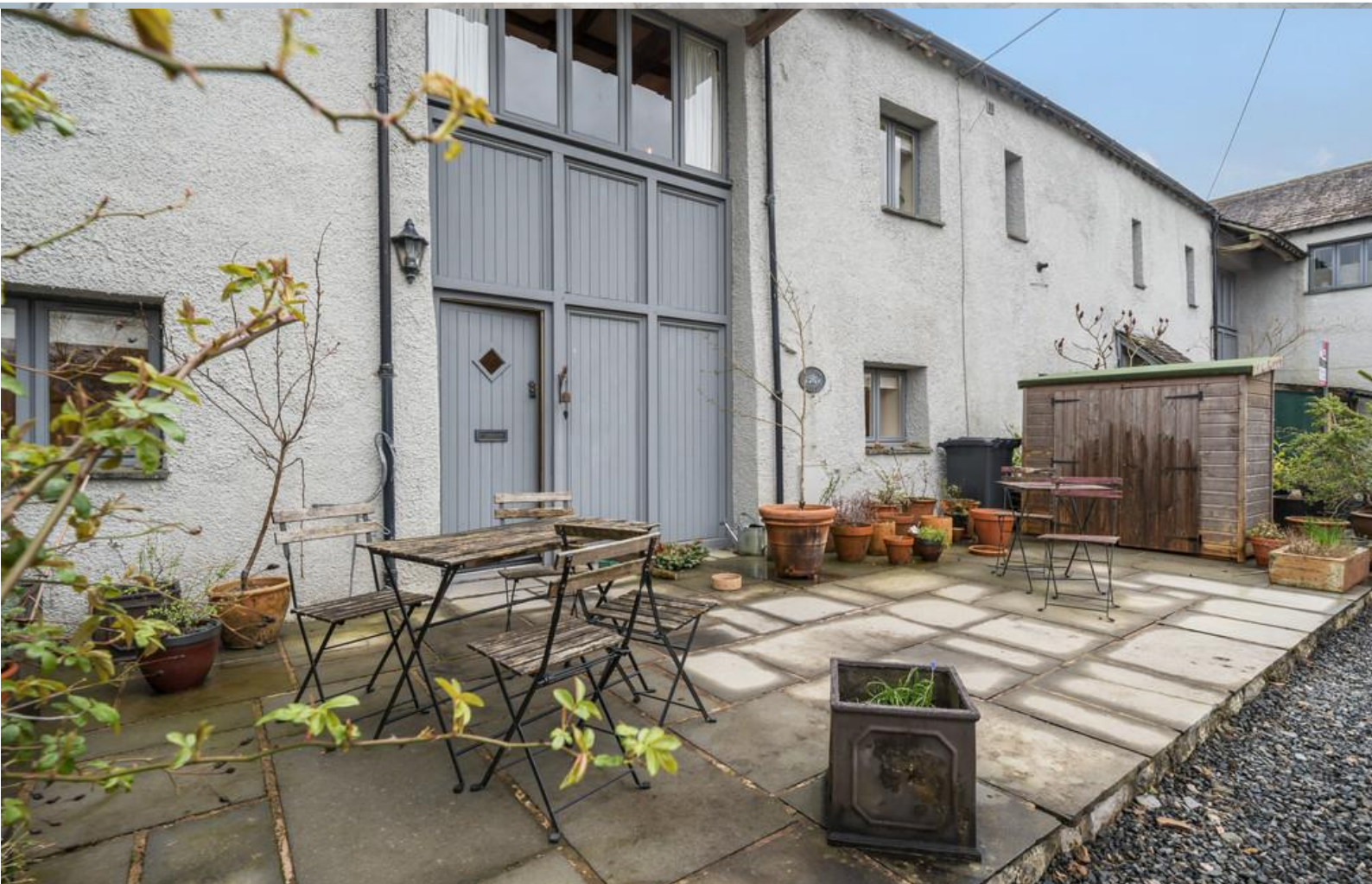
Front Patio/Garden Area

Request a Viewing Online or Call 015395 32301