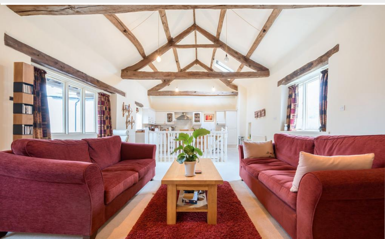
Open Plan Living/Dining/Kitchen